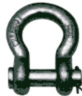
Round pin anchor shackle