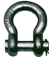
Round pin anchor shackle