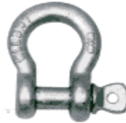
Screw pin anchor shackle